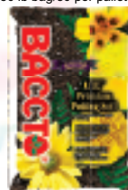
See order form for various sizes

Contains naturally natural organic peat along with a starter and slow release fertilizer. Container Mix is specially blended for large containers, planters, and pots. The product provides for excellent drainage with reduced watering to maximize root and plant development. No mixing or blending required as the product may be used directly from the bag.