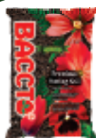
See order form for various sizes

General all purpose potting soil for indoor and outdoor planting that is ready to use right out of the bag. Premium Potting Soil is a blend of naturally nutritious reed sedge peat, lime, perlite, sand, and a starter/slow release fertilizer. Ideal for a multiple of applications including house plants and all types of potting plants.