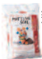
Available in 20 lb, 40 lb, & 50 lb bag

Garden Magic offers the Independent Garden Center quality products from Michigan Peat's bog in Michigan.