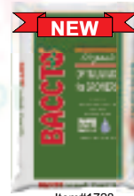
Item#1728 2.8 cf bag/54 per pallet

Contains natural organic peat along with an organic fertilizer. Veggie Mix is formulated specifically for growing vegetables and may be used as a top dressing or direct planting. Veggie Mix also has a higher water retention so less watering is needed. Ideal for raised bed vegetable gardens and pots.