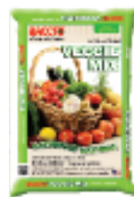
Item#1840 40 qt bag/60 per pallet

Blended natural organic peat along with an organic fertilizer specifically designed for rose growth and production. Rose Mix has a natural water holding capacity that requires less watering. Rose Mix may be used as a outdoor top dressing or for growing roses in all size pots.