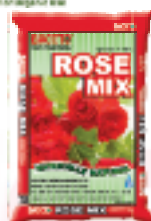
Item#1915 1.5 cf bag/55 per pallet

An odor free blend of peat and composted animal manure. Wholly Cow provides a high nutrient charge making it ideal for nursery plantings, vegetables gardens, both as a top dress or direct planting. Ideal for raised bed gardens