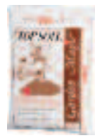
Available in 40 lb & 50 lb bag