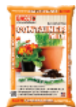
Item #: 1815 1.5 cf bag/55 per pallet

Dark reed sedge peat is blended with sand to offer a product that loosens heavy soil while maintaining excellent water availability. Use directly from the bag for top dressing and patching lawns. Excellent for planting beds along with shrub and tree transplanting.