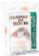
Available in 40 lb bag