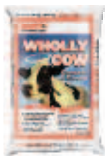
Item#1640 40 qt bag/60 per pallet

An odor free blend of peat and composted animal manure. Wholly Cow provides a high nutrient charge making it ideal for nursery plantings, vegetables gardens, both as a top dress or direct planting. Ideal for raised bed gardens