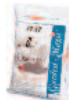
Available in 40 lb & 50 lb bag