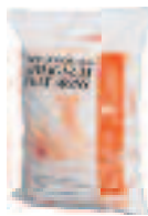
Available in 2 cf bag