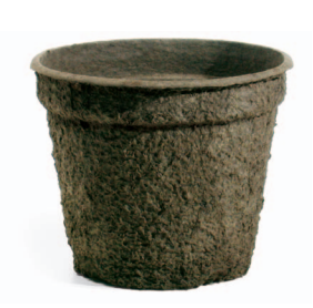
15X13RD 16 ea./case 6.55 gal/24.8 l