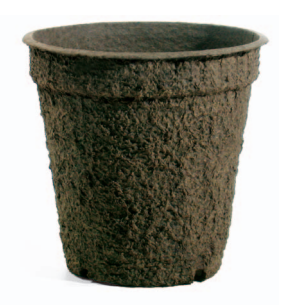
15X16RD 14 ea./case 7.97 gal/30.2 l